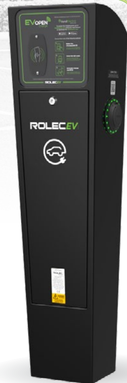
Unit shown: AUTOCHARGE:EV EV OPENCHARGE 2way Socket (Type 2) Charging Pedestal

The AUTOCHARGE:EV OPENCHARGE is a heavy duty, hard wearing EV charging pedestal, specifically designed and manufactured for commercial and public facing environments.